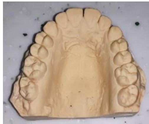
figure No 1: different shapes of rugae area

The rugae pattern can be used among its characteristics as additional method for identification as a reliable guide for personal print and considered a characteristic to discriminate among individuals and emerge as one of the tools for personal identification in forensic science.